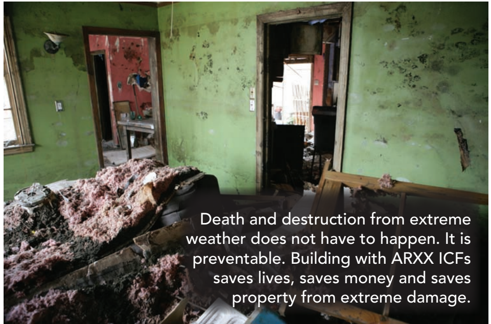
Timber frame home interior destroyed by water damage from Hurricane Katrina.

Heating and cooling can account for up to 70% of a home's energy costs. ARXX ICFs are highly energy-efficient and require 44% less energy to heat and 32% less energy to cool, on average. This means big savings and puts more money