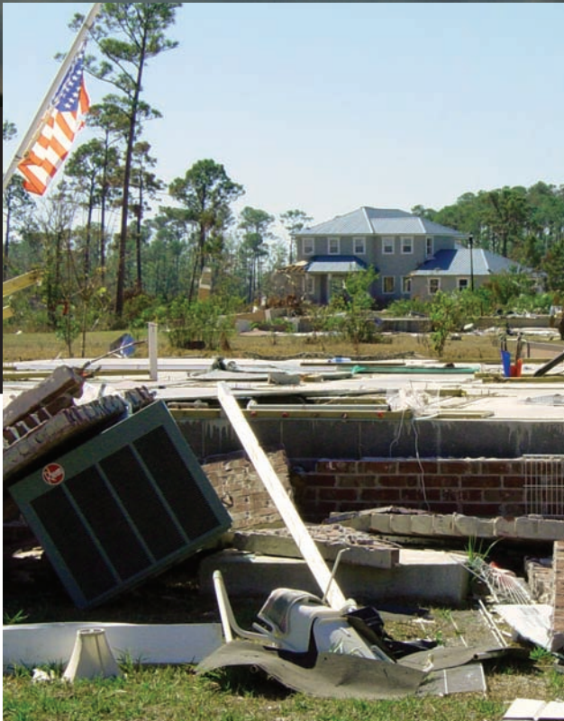
Every home in this neighborhood was destroyed by a category 5 hurricane, except the one built with ARXX ICFs.

Controlling the path of a tornado is NOT an option.